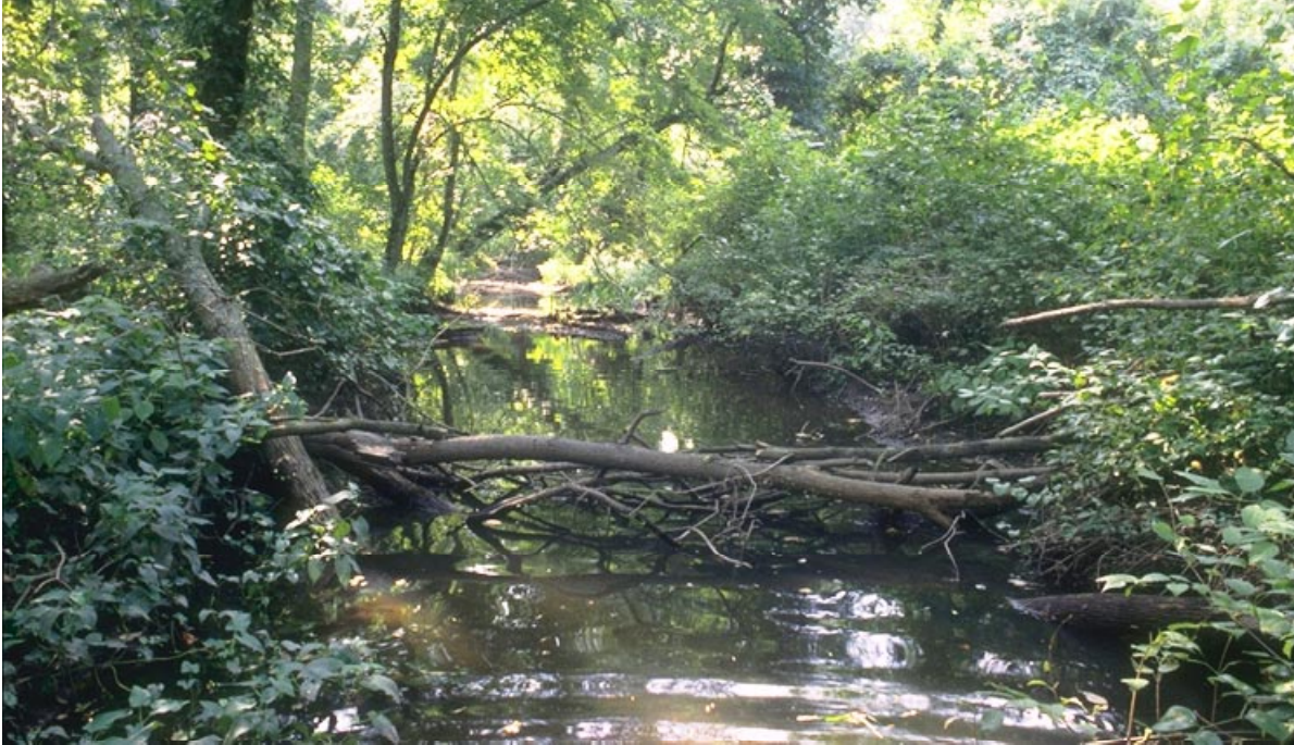
Site 2 - Tappahanna Ditch, Kent County, Delaware